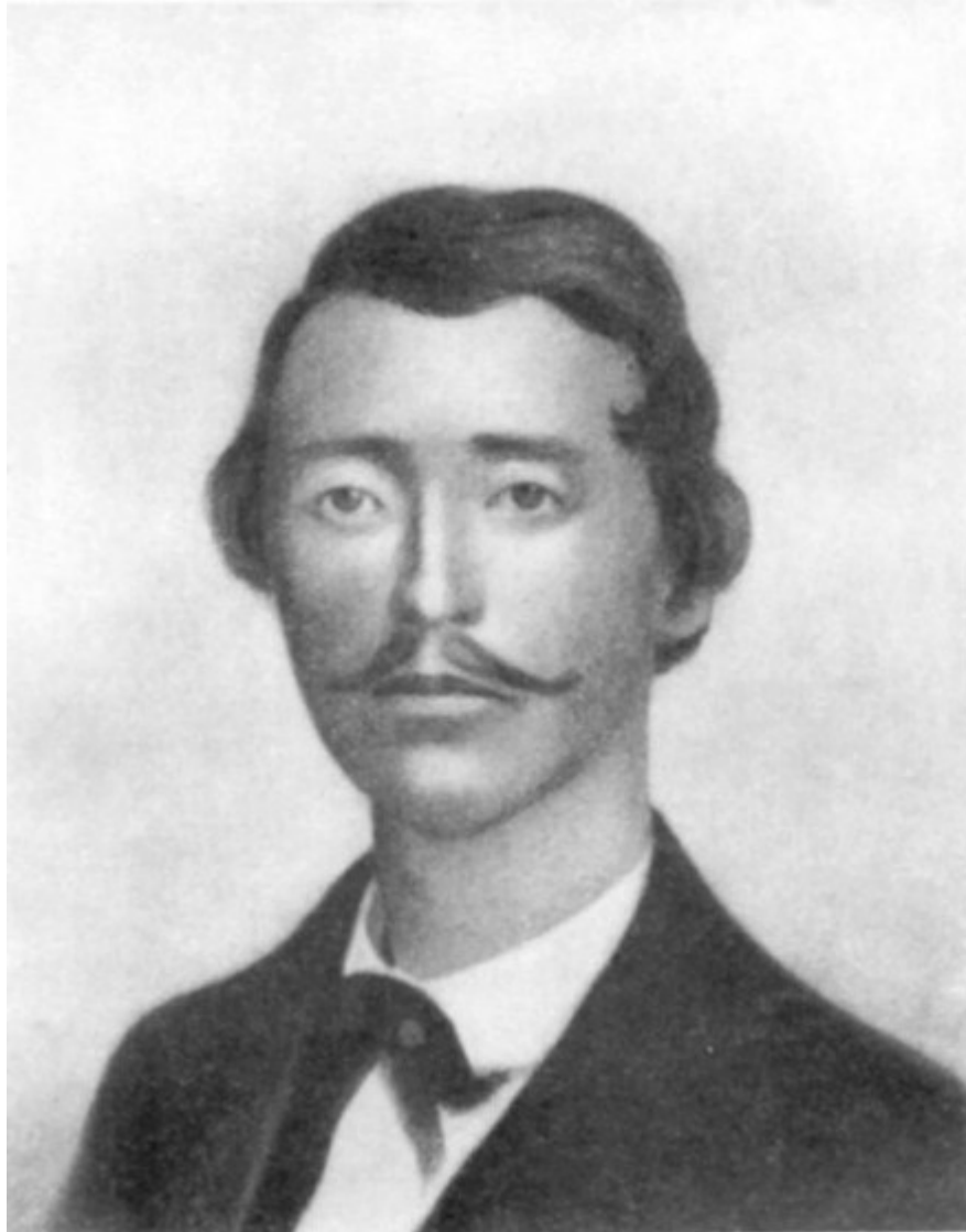
William Clarke Quantrell